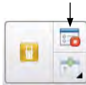
Stop Assessment button

NOTE: An orange Start/Stop Question button in place of a blue Start/Stop Assessment button indicates that you must start and stop each question separately.