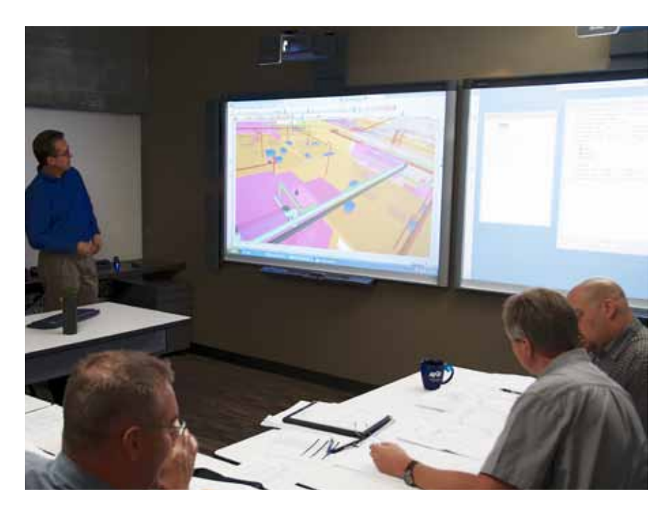
Turner staff lead a coordination meeting in one of their iRooms.