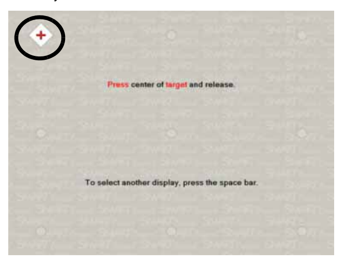
The Orientation screen

2 Begin the orientation process at the upper left-hand corner of the Orientation screen. Press your finger or pen tool firmly on the center of each cross in the order indicated by the white, diamond-shaped graphic.