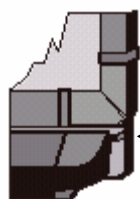
Ready Light on right side of pen tray

The Ready Light indicates the status of your interactive whiteboard. Depending on the model of the SMART Board interactive whiteboard you are using, the Ready Light is located either on the right side of the pen tray or the lower-right side of the frame bezel.